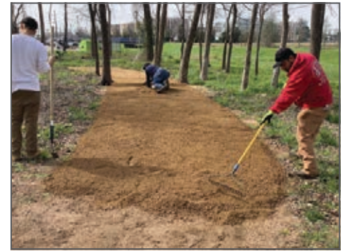
New decomposed granite trails at Jack Drake Park 641 Bradfield Road