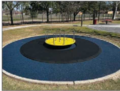
New play mat and play surface at Buckboard Park 70 Buckboard Drive