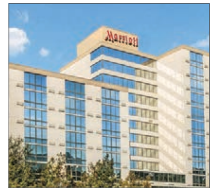
Houston Marriott North