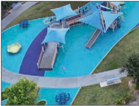
New pour-in-place play surface at Dylan Park 12351 Kuykendahl Road

These improvements reflect the District’s ongoing investment in high-quality public spaces that serve both residents and businesses. As always, drivers are encouraged to slow down and stay alert for Field Services crews working throughout the District.