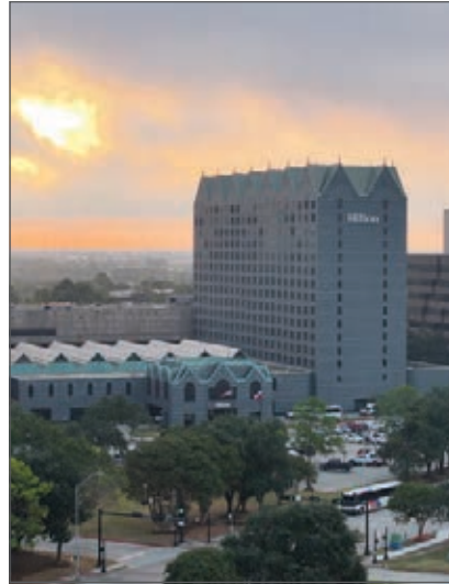
Hilton Houston North

The North Houston District is home to quite a few business travel-focused hotels. This segment of the market comprises everything from a La Quinta Inn or Hampton Inn up to Hilton and Marriott branded hotels (“upper midscale” to “upper upscale” in hospitality lingo). All together there are 12 such properties comprising 1733 rooms in the District.